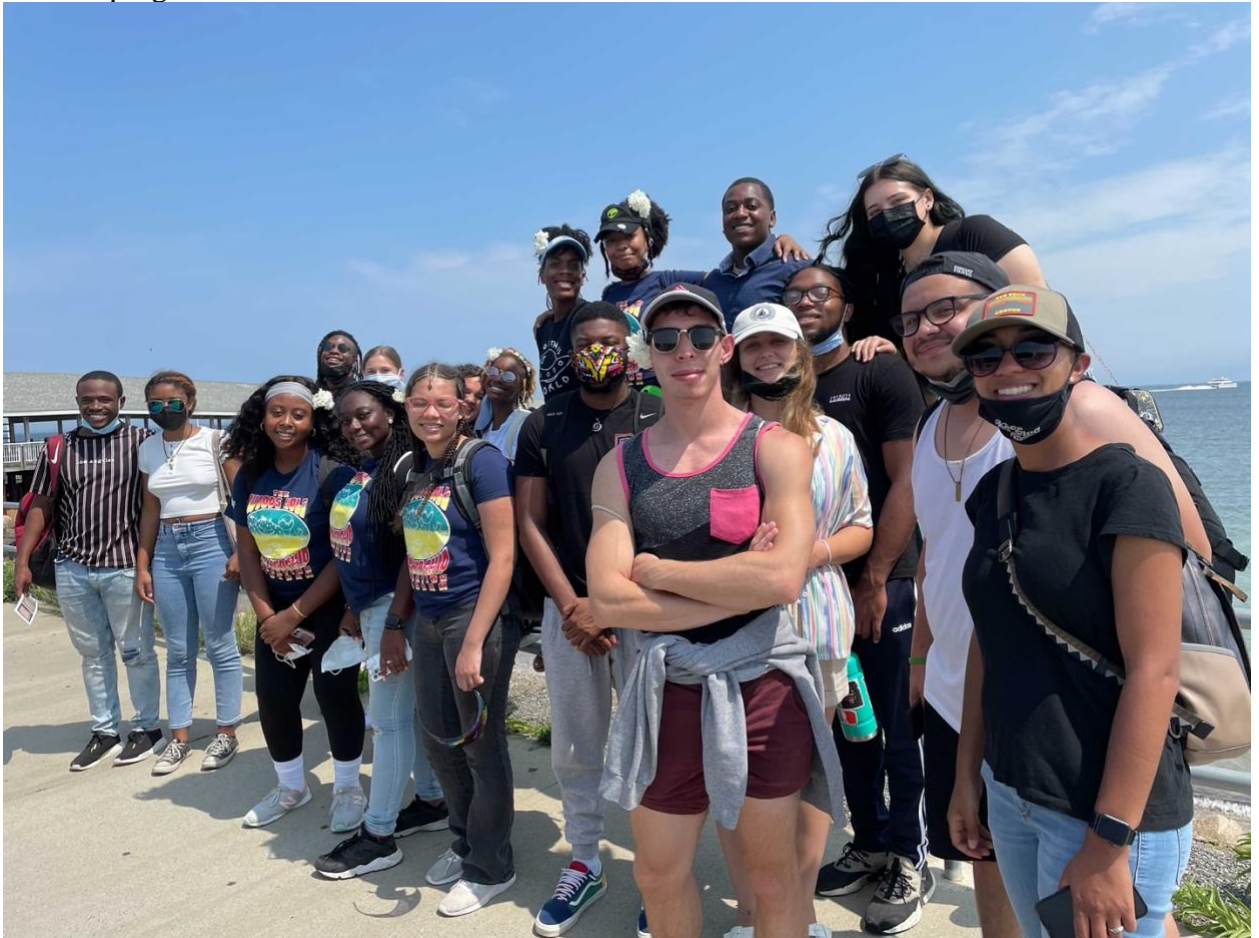
Figure 1: The 2021 PEP II Researchers, PEP students and PEP staff on Martha's Vineyard

encourage the interns and to ensure that the interns are having a productive experience in all elements of the program.